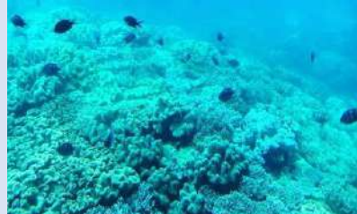
Blue Carbon Cruise "Glass Boat"