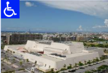
Okinawa Museum/Art Museum