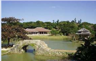
Shikinaen Royal Garden