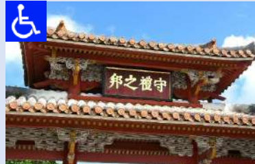
Shuri Castle Park