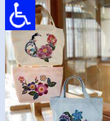
Shuri Textile Museum suikara