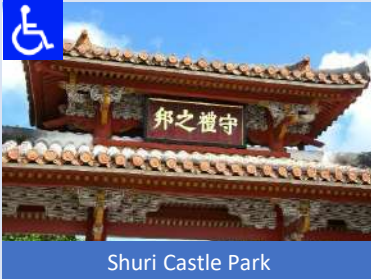
Shuri Castle Park